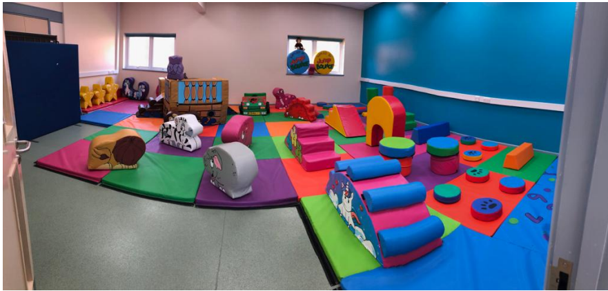
There will be a room with trampolines, this is what it looks like. The trampolines are great for bouncing on.